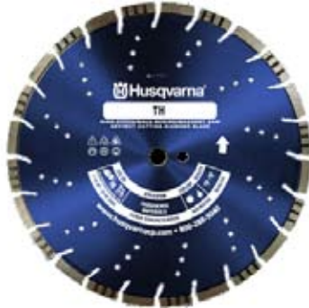
HUSQVARNA VARACUT SERIES 2 STAR Rating

25-542774540 12" 25-542774541 14" 25-542774542 16"