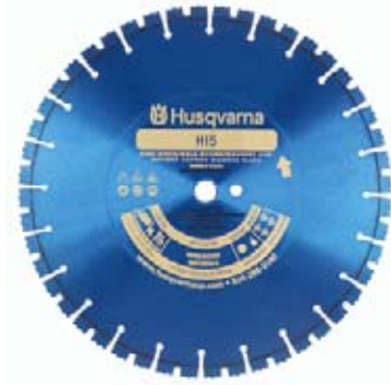
HUSQVARNA HI5 4 STAR Rating

This all purpose diamond blade has aggressive notched segments to grab and grind material for a rapid cut. It is used for fast cutting a wide variety of materials on the first pass such as cured concrete and brick. Segment height is .475" (.375" diamond depth).