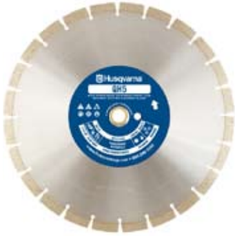
HUSQVARNA QH5 2 STAR Rating

A general purpose diamond blade for cutting cured concrete and brick. A great value-priced blade. Segment height is .450" diamond depth.