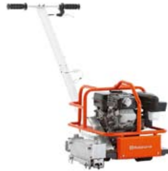
HUSQVARNA SOFF-CUT® 150D

Ultra-early concrete cutting system to reduce random cracking. Designed especially for the contractor who wants a no-hassle way to make decorative cuts.