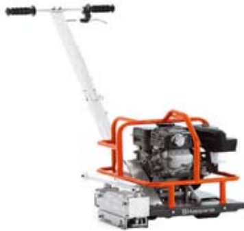
HUSQVARNA SOFF-CUT® 150

Ultra-early concrete cutting system to reduce random cracking. Designed for residential and commercial applications.